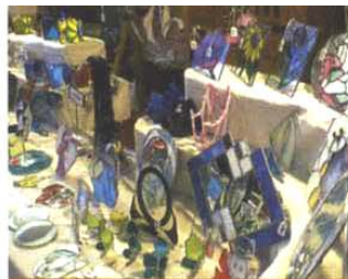
Christmas Craft Fair