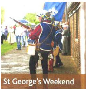
St George's Weekend