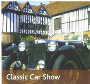
Classic Car Show