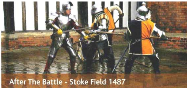
After The Battle - Stoke Field 1487